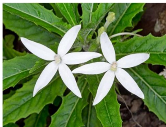
FIGURE 1. Kitolod plants ( H. longiflora ) 13,35

Kitolod ( H. longiflora ) is a type of plant that is believed to have potential as a traditional medicine (FIGURE 1). It is also called Isotoma longiflora Presi. The kitolod plant originates from the West Indies area, but this plant has spread and is found widely in the tropics. Kitolod plants have characteristics, which are easy to grow among rocks in moist conditions, around the edges of ditches, and are even found around the yards of houses so these plants are generally known as wild plants. 13